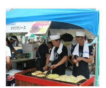
Please visit Charity market tent for victims of last year's Earthquake and Tsunami hit on Tohoku area.